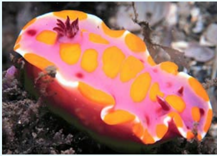
Ceratosoma amoena is common at most of the Port Stephens dive sites. It displays a wide variation from pale to bright pinks and yellows.