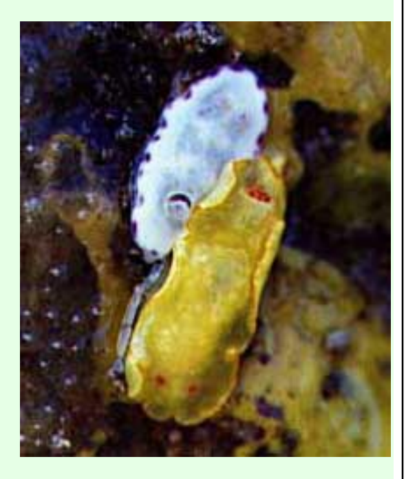
Image the surprise of turning over a rock to find five different species and this pair together.

Noumea laboutei and Chromodoris rufomaculata