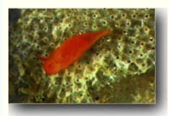
fig. 2. V. calendonica

Returning to the platform several days later many more specimens were located, notably in the higher reaches of the intertidal zone.