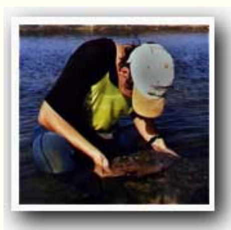
fig. 3. This particular rock high up in the intertidal zone had at least eight specimens under it.