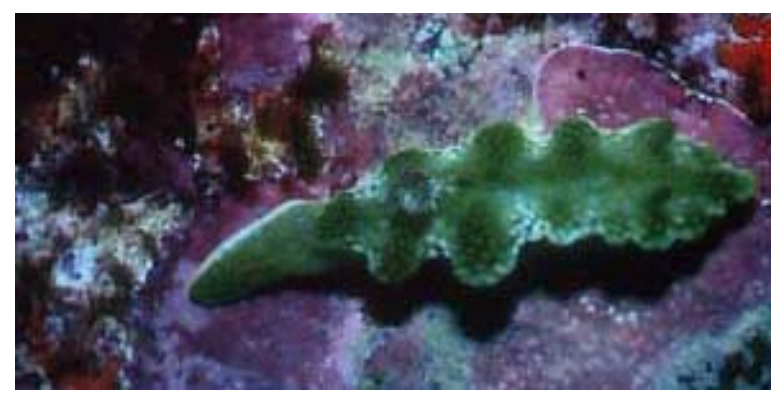
Sinuate ceratosoma Ceratosoma sinnuta (50mm). Found in the open on a wall during the day this specimen displays the very distivnctive "nose" sen on semi adult specimens when observed from the dorasal aspect. Shape and colouration is typical od Lord Howe Island / NSW specimens.