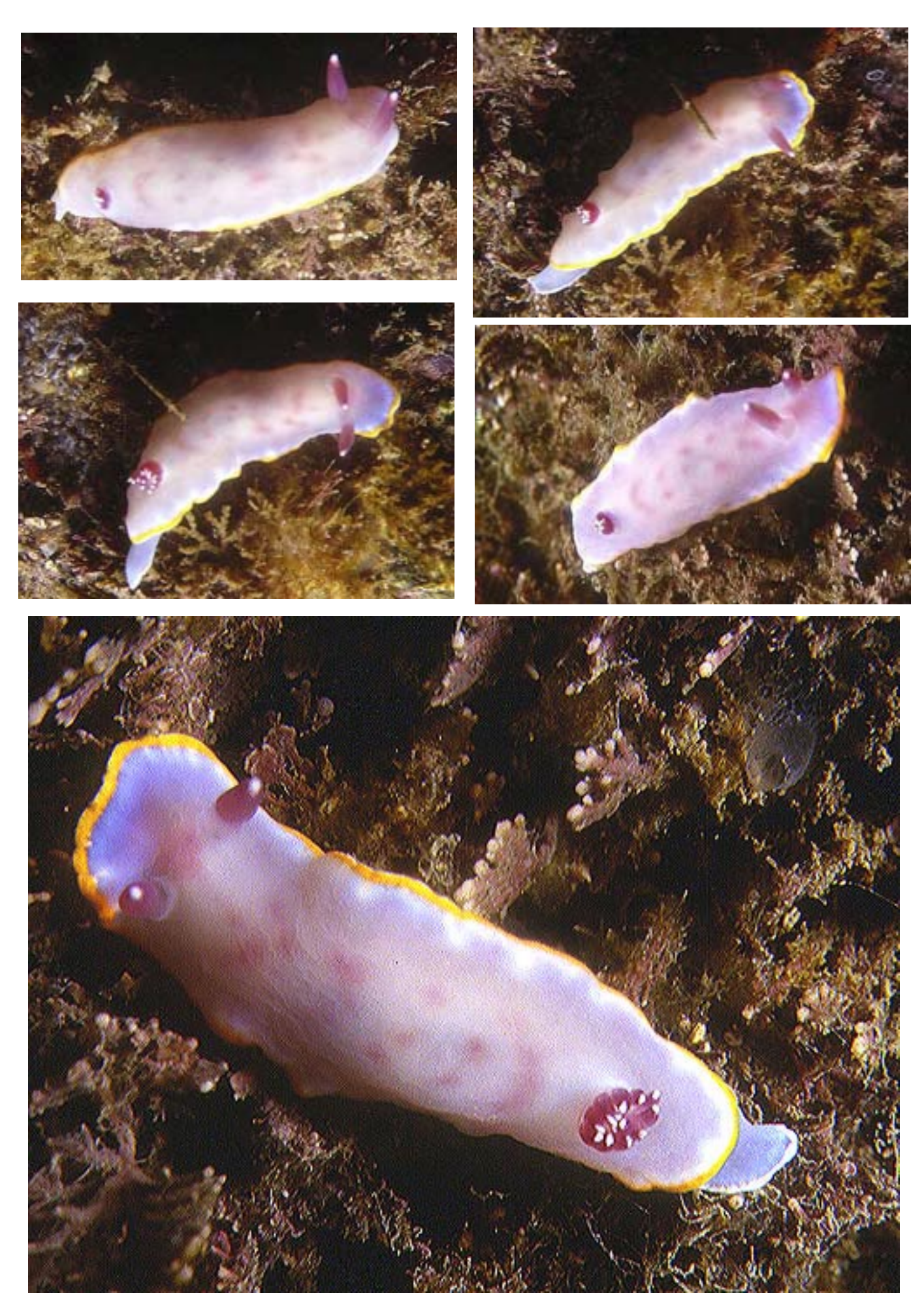
nudibranch NEWS Vol.3 No.6: 61 February 2001