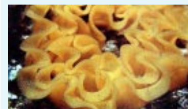
The aeolid, Favorinus brachialis (Rathke, 1806) reportedly feeds on P. argo eggs.